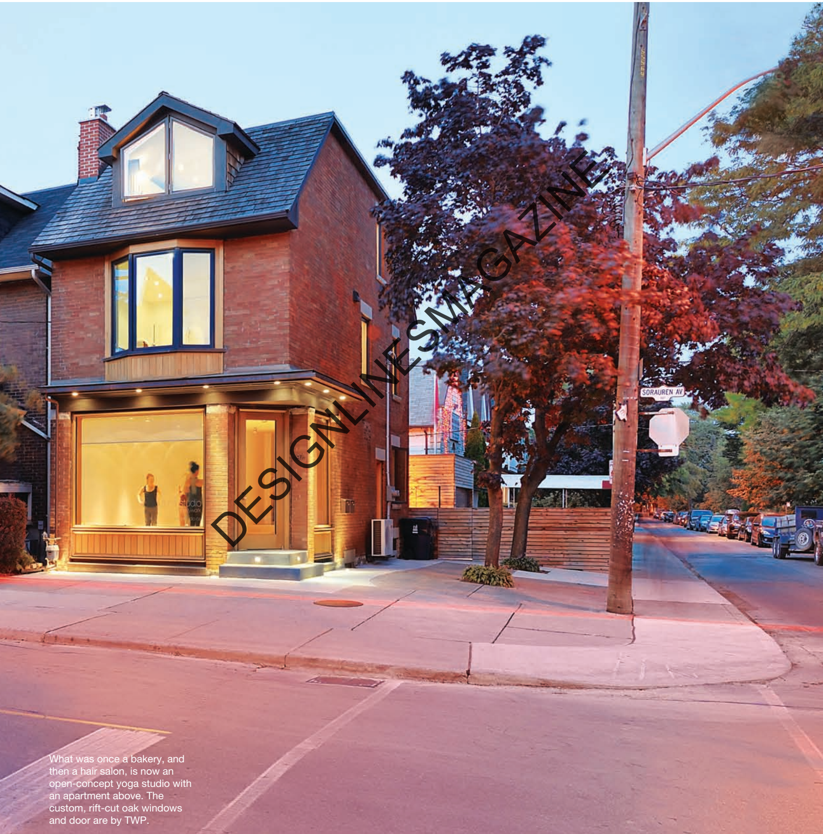
What was once a bakery, and then a hair salon, is now an open-concept yoga studio with an apartment above. The custom, rift-cut oak windows and door are by TWP.